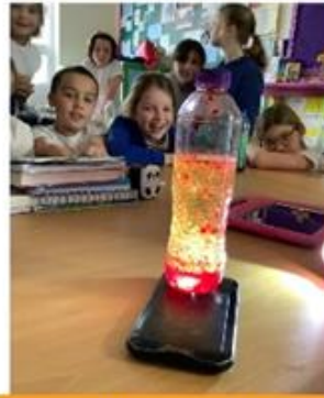
Lava lamp fun!