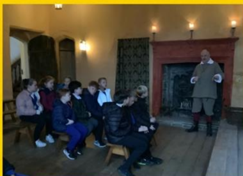
Our trip to Llancaich Fawr Manor

Dosbarth Coed have really enjoyed the lead up to Christmas and have worked hard to think about how we wait joyfully and patiently during the Advent season. In RE we have discussed various accounts of the nativity that we have found in the Bible and even created our own modern day Nativity scene pictures! We enjoyed talking about the activities we do in the lead up to Christmas and have made tally charts and bar graphs using the information from our class survey. We have continued with our topic based on the Tudors - Mighty Monarchs - and really enjoyed our trip to Llancaich Fawr Manor where we even met some Stuart servants who told us all about their master and the house they live in. We loved seeing the different rooms of the manor and talking about what daily life was like during Tudor and Stuart times. We are looking forward to continuing with our topic after Christmas and finding out more about the monarchs of Tudor and Stuart times. We have also been very creative in the lead up to Christmas, making Christmas cards, calendars and Christmas crafts! Nadolig Llawen pawb!